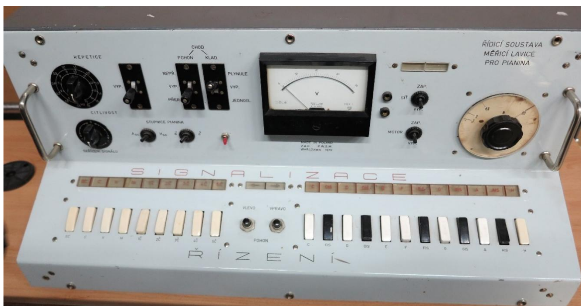
Fig. 1: Original equipment constructed in 1960s