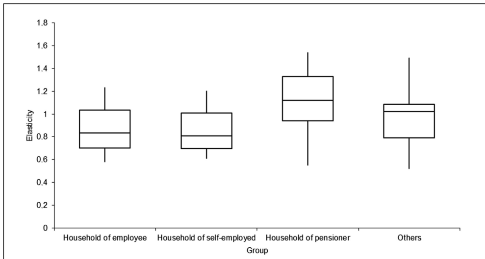
Fig. 2: Box plot of elasticity of households according to economic status

The examination of the households classified by an economic activity of their head has shown that in the households with an employed